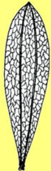
with two longitudinal veins and anastomosing veins between