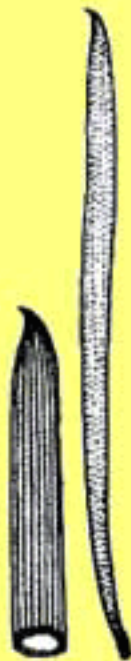
with many longitudinal veins