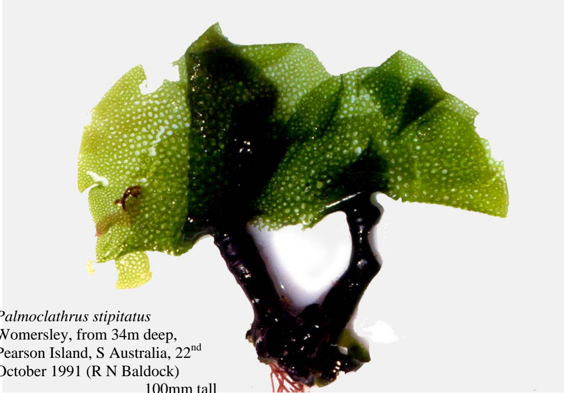
Palmocladus stipitatus Womersley, from 34m deep, Pearson Island, S Australia, 22 nd October 1991 (R N Baldock) 100mm tall