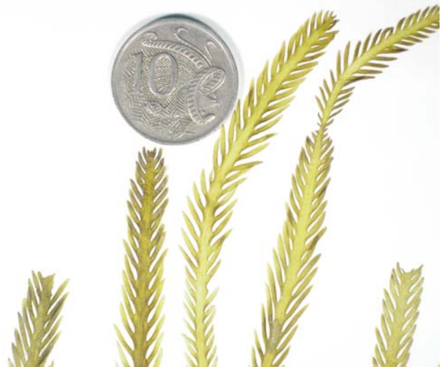
Two magnifications of Caulerpa scalpelliformis (R. Brown ex Turner) C. Agardh (A46806), a narrow, calm water form from Coffin Bay, S. Australia